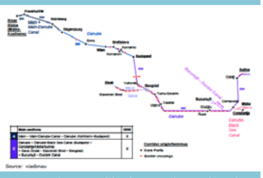
IWW alignment of the Rhine-Danube Corridor and assigned infrastructure

in order to avoid a further delay of the necessary measures to guarantee the fairway rehabilitation. The inland navigation industry in the past suffered huge losses due to the lack of the maintenance of the waterways.